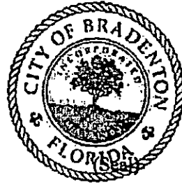
Exhibit D 67-37.005(1), F.A.C. 2023